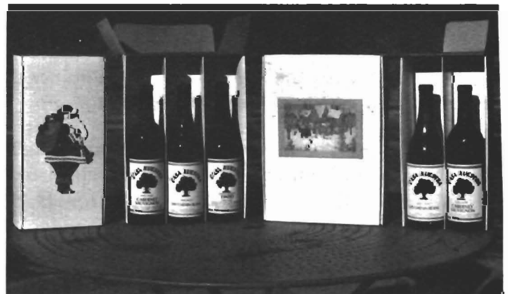
The three-bottle gift pack contains Chenin Blanc, Cabernet, and Tinto: $20 plus tax ($21.20). The two-bottle gift pack contains Chenin Blanc and Cabernet for $15 plus tax ($15.90). Minimum order, twelve bottles.

Please note that our gift boxes are not suitable for UPS shipment. If you want to ship wine by UPS, please call, and we can make special arrangements for you.