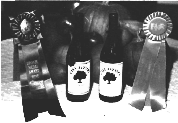
Casa Nuestra wines honored at San Francisco, Los Angeles, and Riverside competitions.